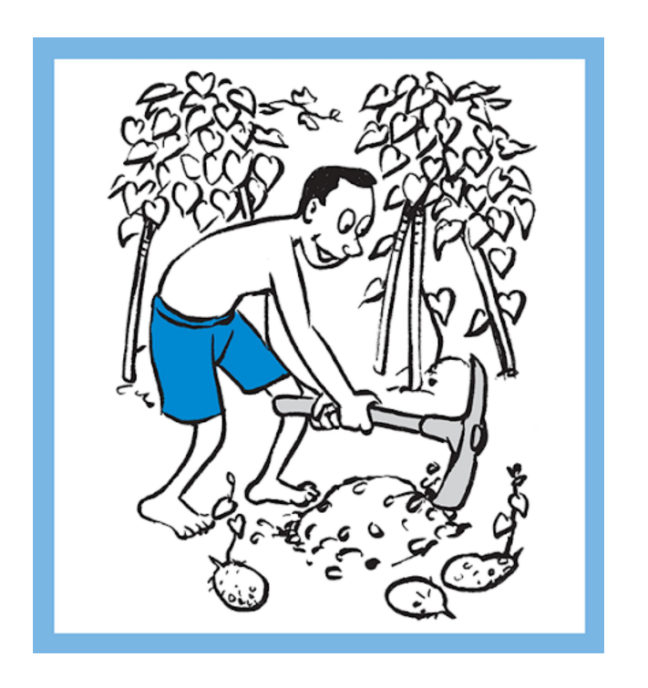
Endakali mendapuame eenya nee pokengema. Akali dakeme eenya nee pokelyamo.

Some people help others by working in hospitals. This woman is fixing this boy's broken arm and putting it in a cast.