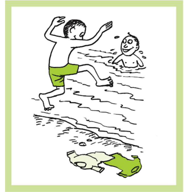
Male petala supimi leambi.