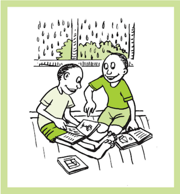
Male petala buku itaki piambi.