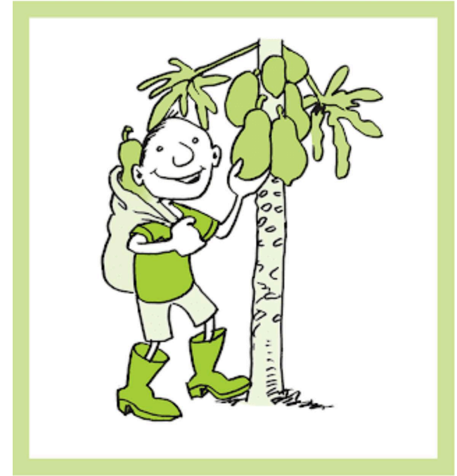
Baame paupau mendatupa lyao mandilyamo.