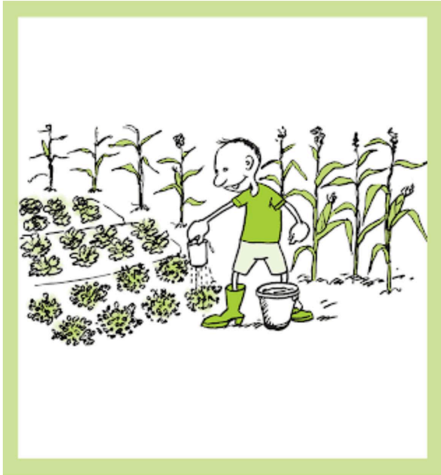
Wane dakeme eenya kalai pilyamo.